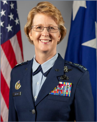
COMMANDER Lieutenant General Donna Shipton

Specifically, AFLCMC supports approximately 1,300 USAF and nearly 2,900 FMS programs totaling $469B in FY25 execution.